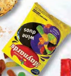
Maynards Mini Wine Gums Duos 60g R25