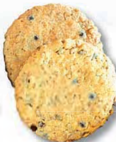
Giant Cookie Muesli or Choc Chip 90g R30