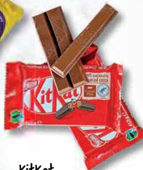
KitKat 4 Finger Milk Bar R25