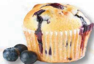
Fresh Muffin Blueberry R35