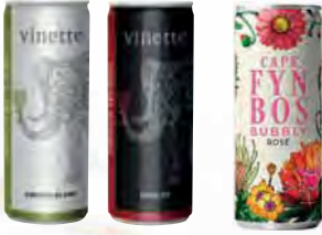
Vinette Wine Chenin Blanc or Merlot 250ml R60

Crisp and fruity → Rich berries → Fruity floral →