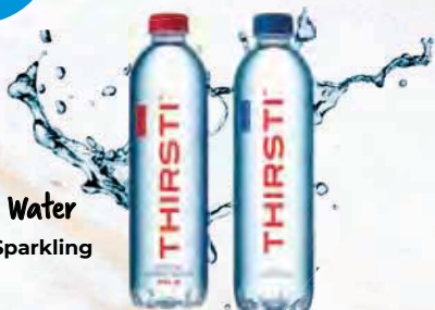
Thirsti Water Still or Sparkling 500ml R18