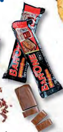
Bar-one Bar 52g R25